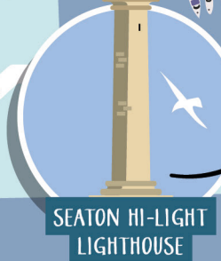
SEATON HI-LIGHT LIGHTHOUSE