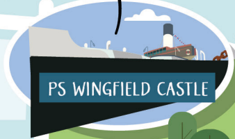
PS WINGFIELD CASTLE