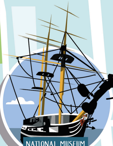
NATIONAL MUSEUM OF THE ROYAL NAVY HARTLEPOOL