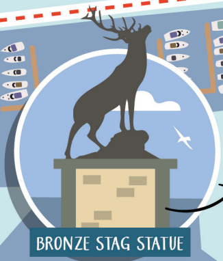
BRONZE STAG STATUE