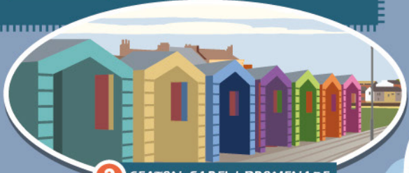
2 SEATON CAREW PROMENADE