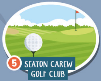
5 SEATON CAREW GOLF CLUB