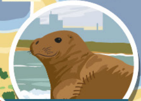
7 TEESMOUTH NATIONAL NATURE RESERVE