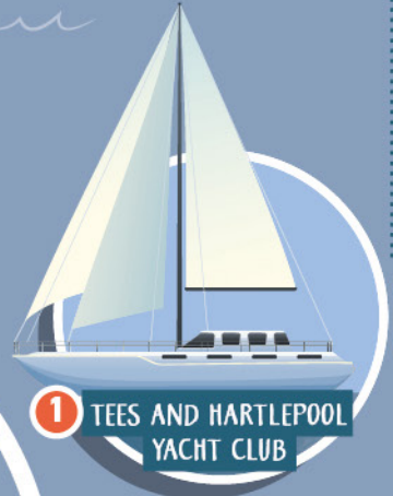
1 TEES AND HARTLEPOOL YACHT CLUB