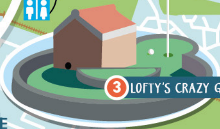
3 LOFTY'S CRAZY GOLF